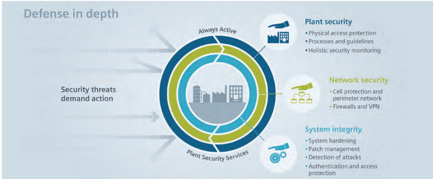
Figure 1. Defense-in-depth for ICS networks and the OT systems those networks support, with the Siemens SNOK IDS solution providing an early warning system for detecting attacks to strengthen system integrity.