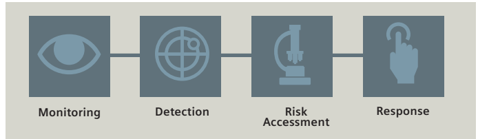
Figure 3. Four components of SNOK application.

How it works. The SNOK application operates quietly behind the scenes, using the four components illustrated below to alert system owners of intrusions that traditional IT security tools might miss: Monitoring; Detection; Risk Assessment; and Response.